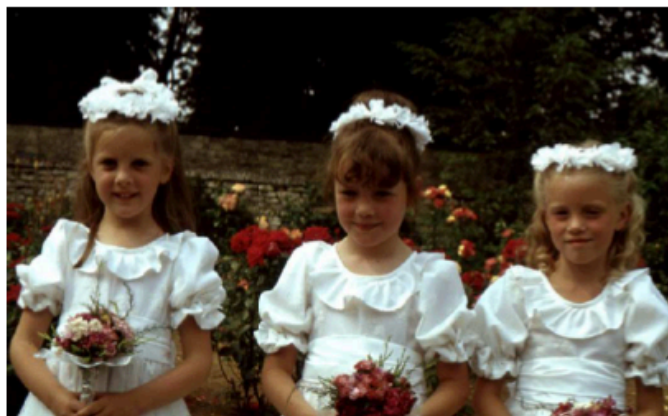
The Queen's attendants