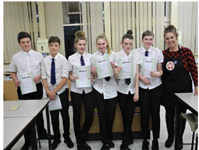
The six 'Young Chef' competitors