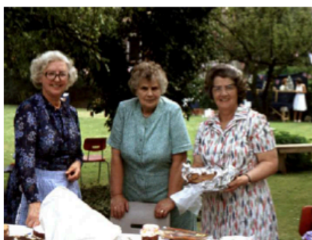
cake stall ladies →