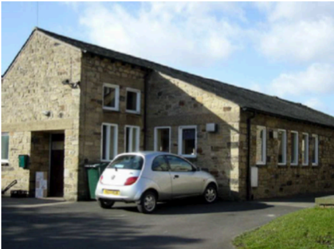
St Wilfrid's Church Hall