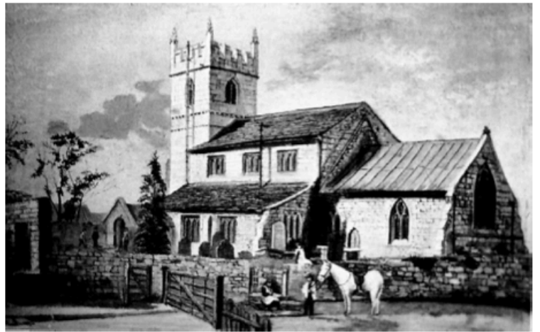
St Wilfrid's circa 1890