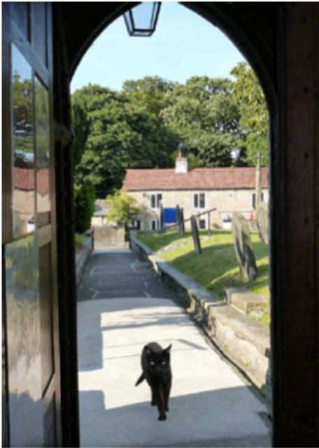
A welcome to all!