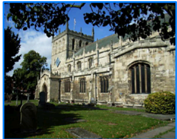
St Laurence Priory Church, Snaith