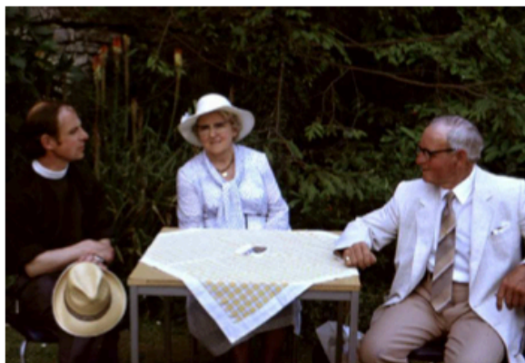
Rector with guest openers